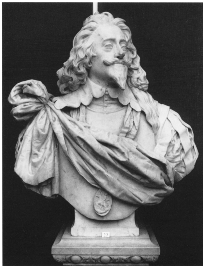
43. Charles I, perhaps by Thomas Adye or Francis Bird (c.1737–44) after a 17th-century original possibly by François Dieussart. Marble.