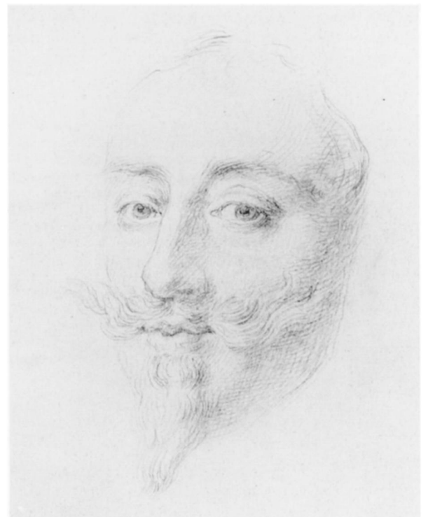
45. Drawing of a plaster cast of Charles I , by Jonathan Richardson Sr. Black lead, on vellum, 15 by 20 cm. (Ashmolean Museum, Oxford).