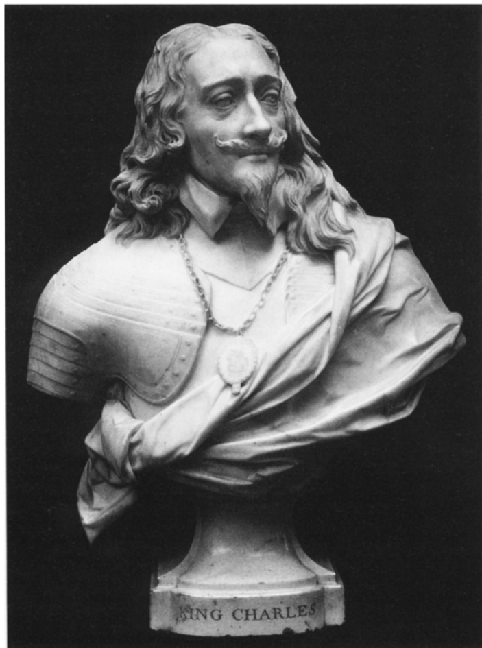
48. Charles I , by François Roubiliac. Marble, 71 cm. high (The Wallace Collection, London).

Richardson shows the same sharp cut at the neck, where one supposes the collar must have been sculpted on Bernini's original.